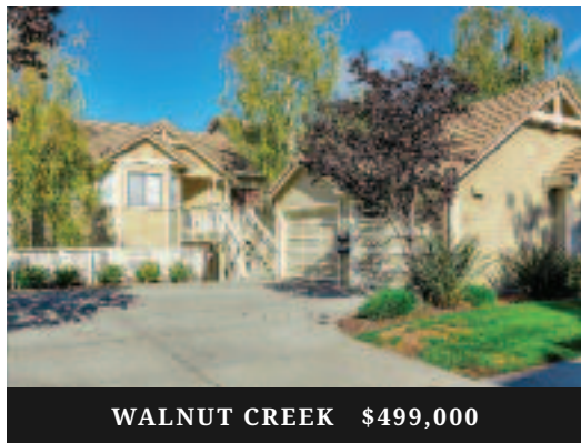
WALNUT CREEK $499,000

9 Birch Court | 2bd/2ba Shirley Sutton | 925.258.1111